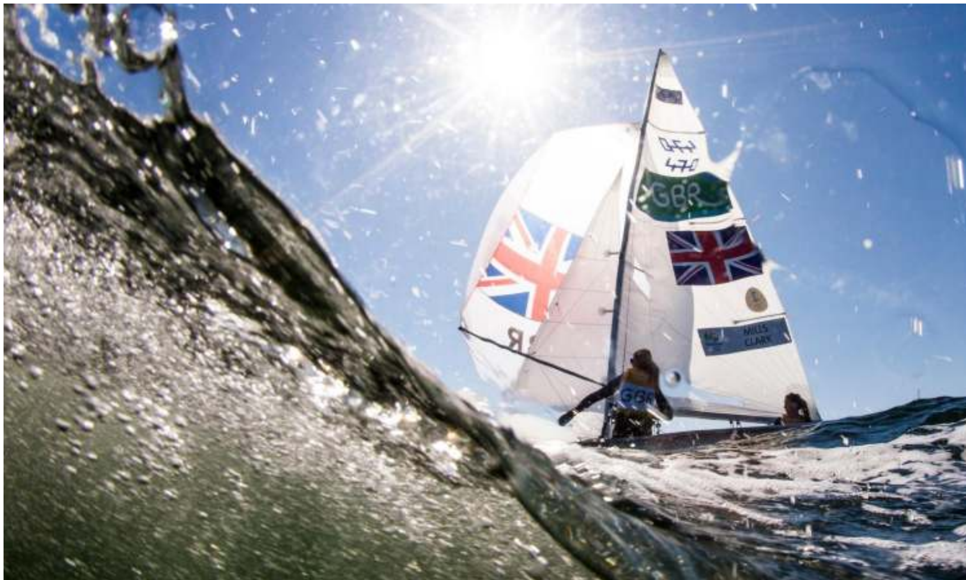
Hannah Mills/Saskia Clark (GBR) Silver Medal - 2012 Olympics, Gold Medal – 2016 Olympics