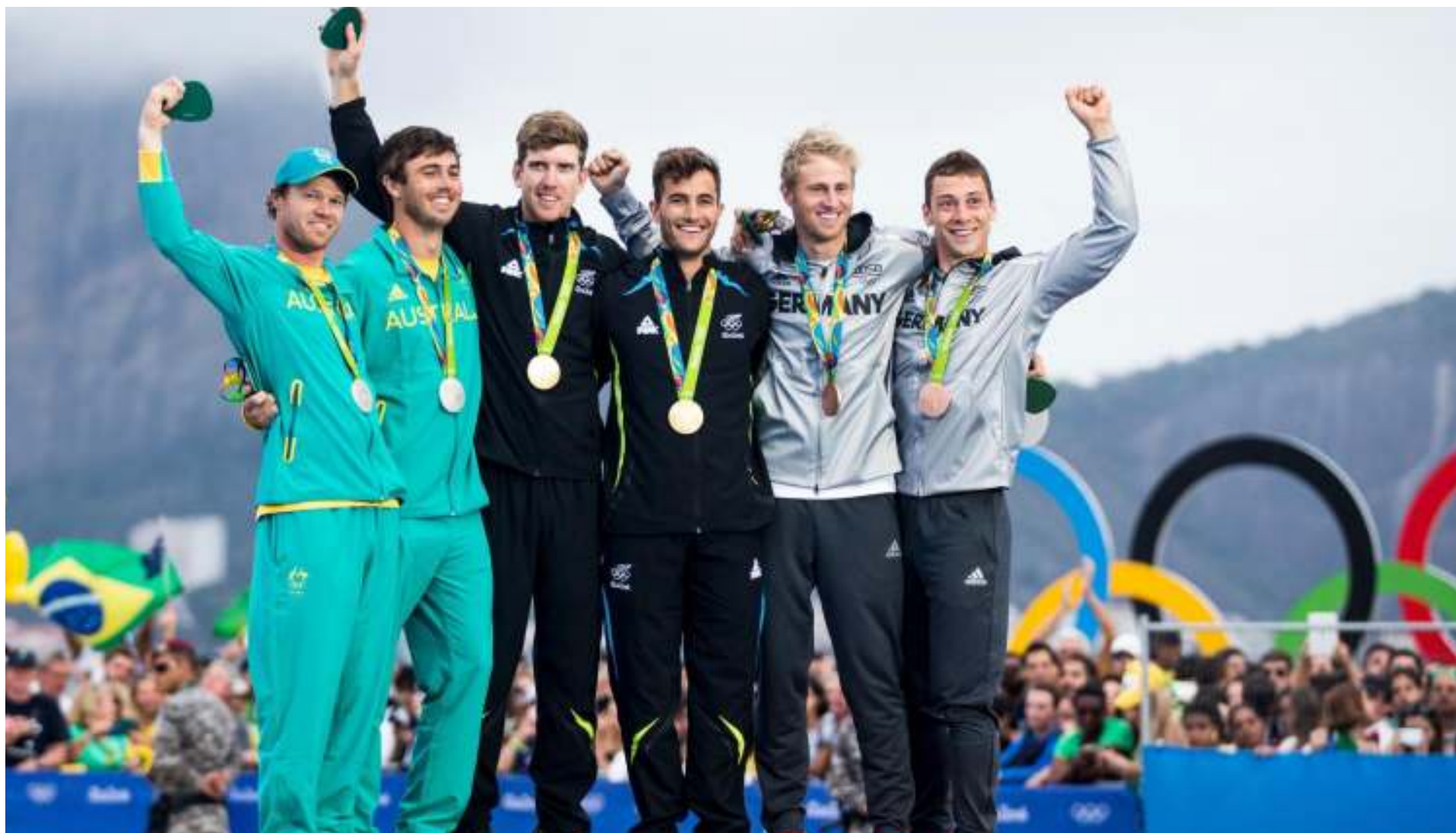
Peter Burling (NZL), 49er helm: Gold - 2016 Olympics Nathan Outteridge (AUS), 49er helm: Silver - 2016 Olympics Erik Heil (GER), 49er helm: Bronze - 2016 Olympics