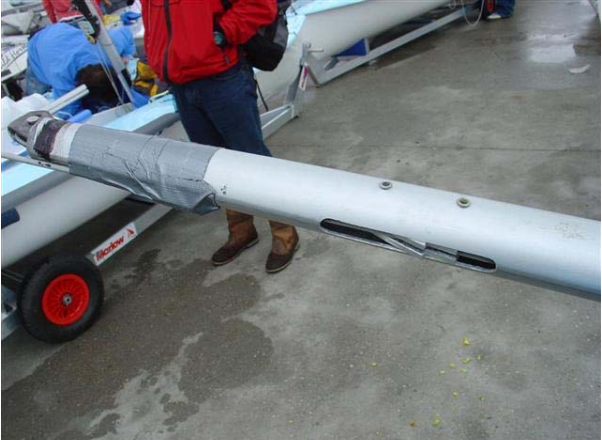
Solution No1, Mast head lock. Those who have this kind of fitting installed don't need a separate stopper since this arrangement only permits a single position for the mainsail. Just make sure your sail fits exactly within the limits!

2) It is advisable not to ask mast manufacturers to pre-install spar stoppers because they don't know the exact shape of the mainsail head used by their customers. Below you see some common forms of a mast stopper: